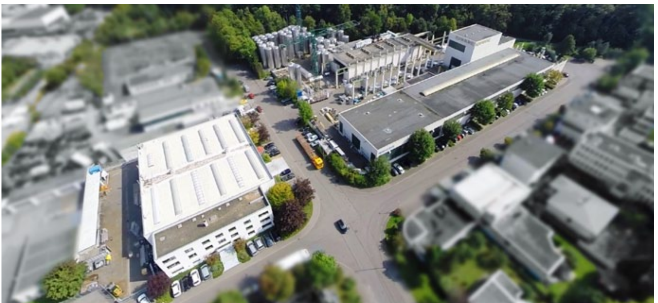
Head office and production facilities in Bietigheim-Bissingen

Today around 150 employees are what make the company one of the leaders in technology and quality in the field of tank and vessel manufacturing.